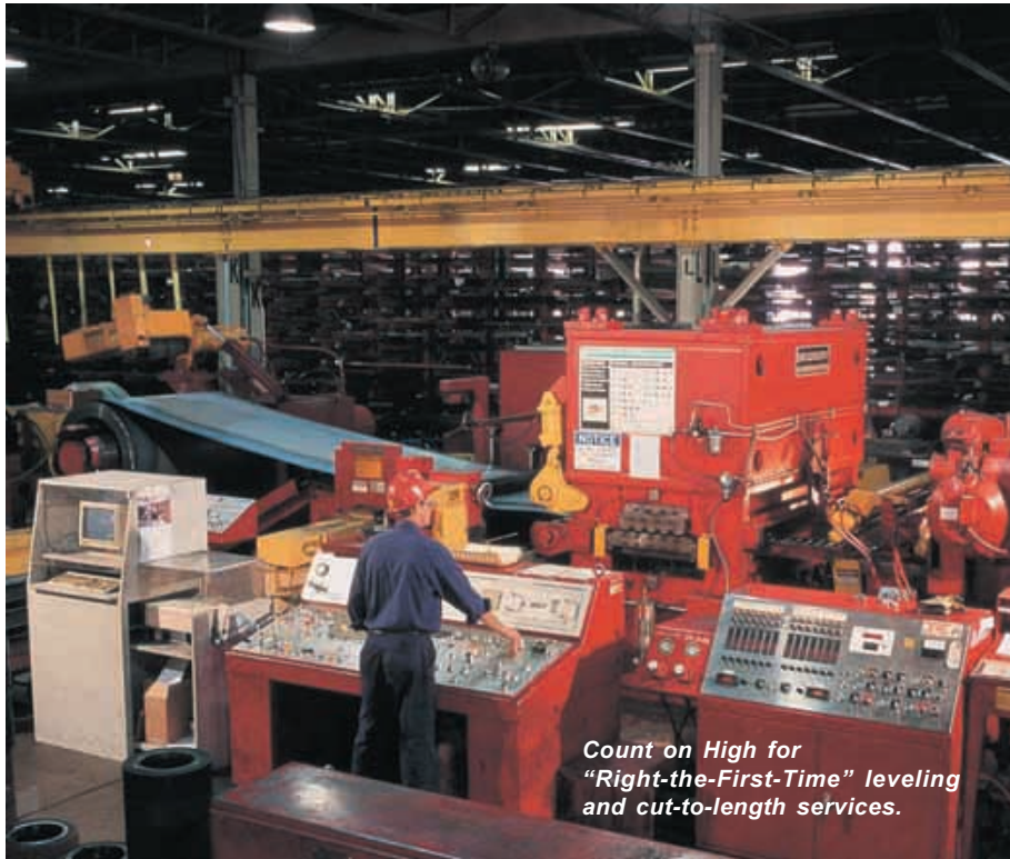
Count on High for "Right-the-First-Time" leveling and cut-to-length services.