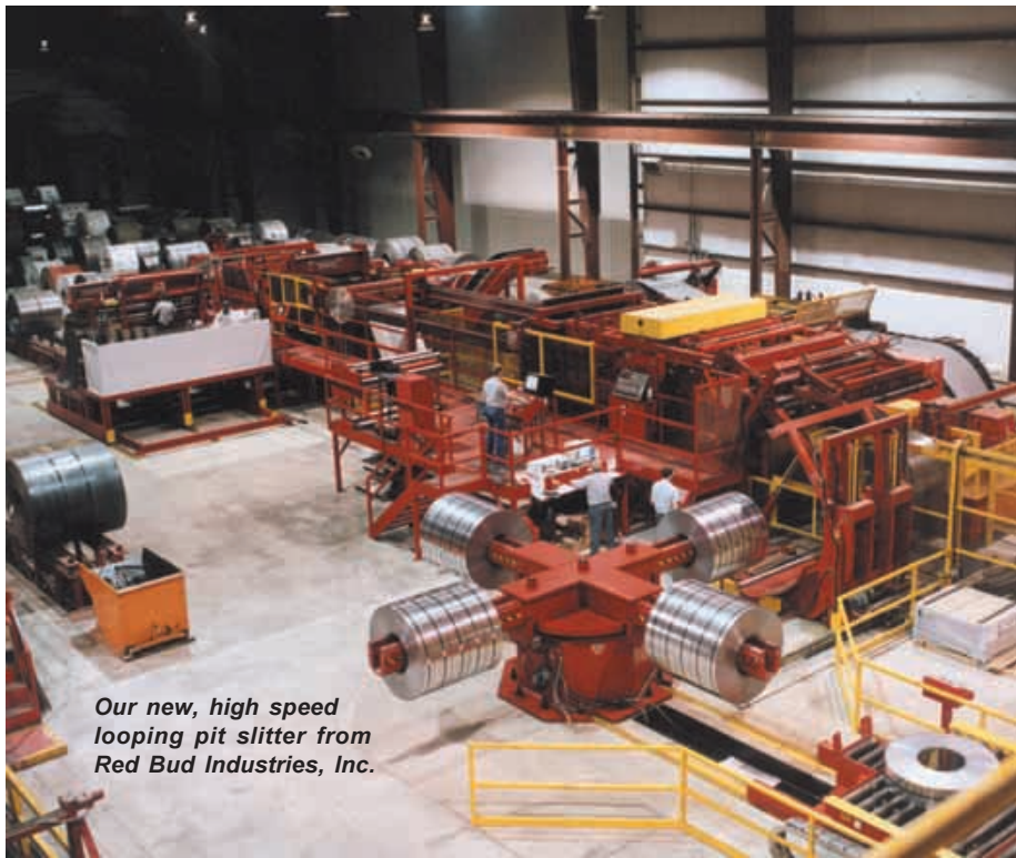
Our new, high speed looping pit slitter from Red Bud Industries, Inc.